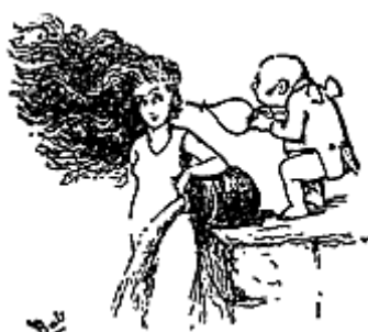
The fickle breeze