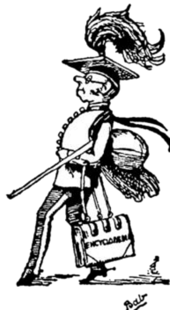
The Modern Major-General