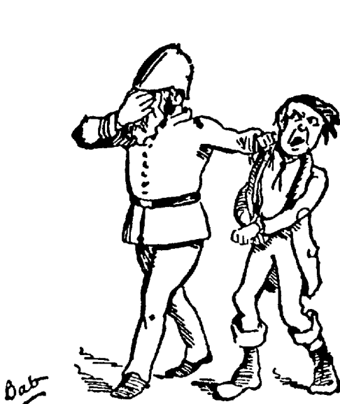
A Policeman's lot is not a happy one.

Regrettably I'm driven to the conclusion that W. S. Gilbert just didn't think this through properly. Of course, "No Pirate band will take its stand/ at the Truro Assizes" doesn't scan as well, but is that a good enough reason for sacrificing legal accuracy? I don't think so.